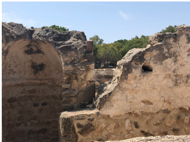
Prayer Cells – with the intact exposed Mibrab (small vaulted area)

than gradual depopulation. There are remarkable surviving small prayer cells and a mosque both with similar structure, although each served a different purpose.